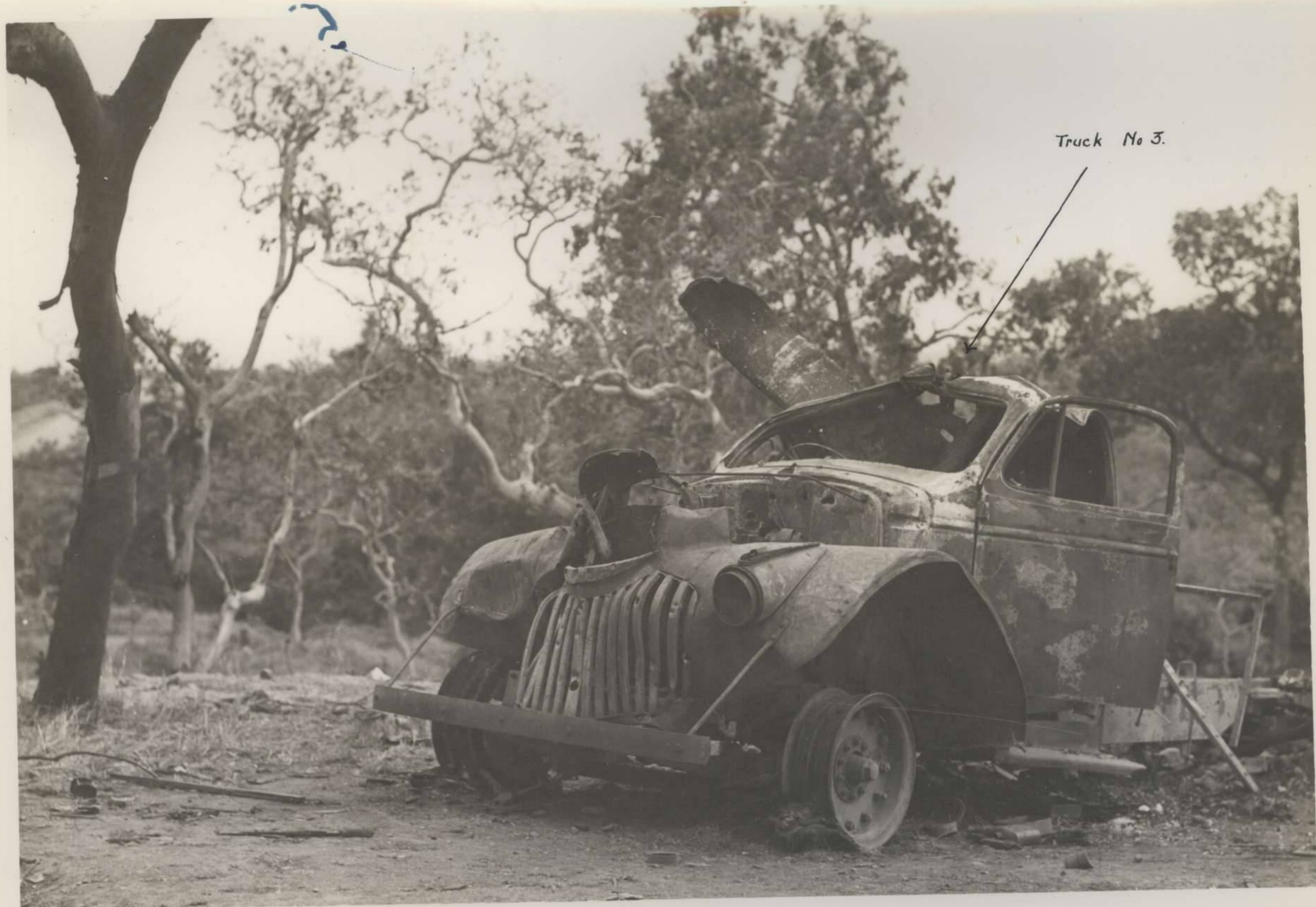
Truck No 3.