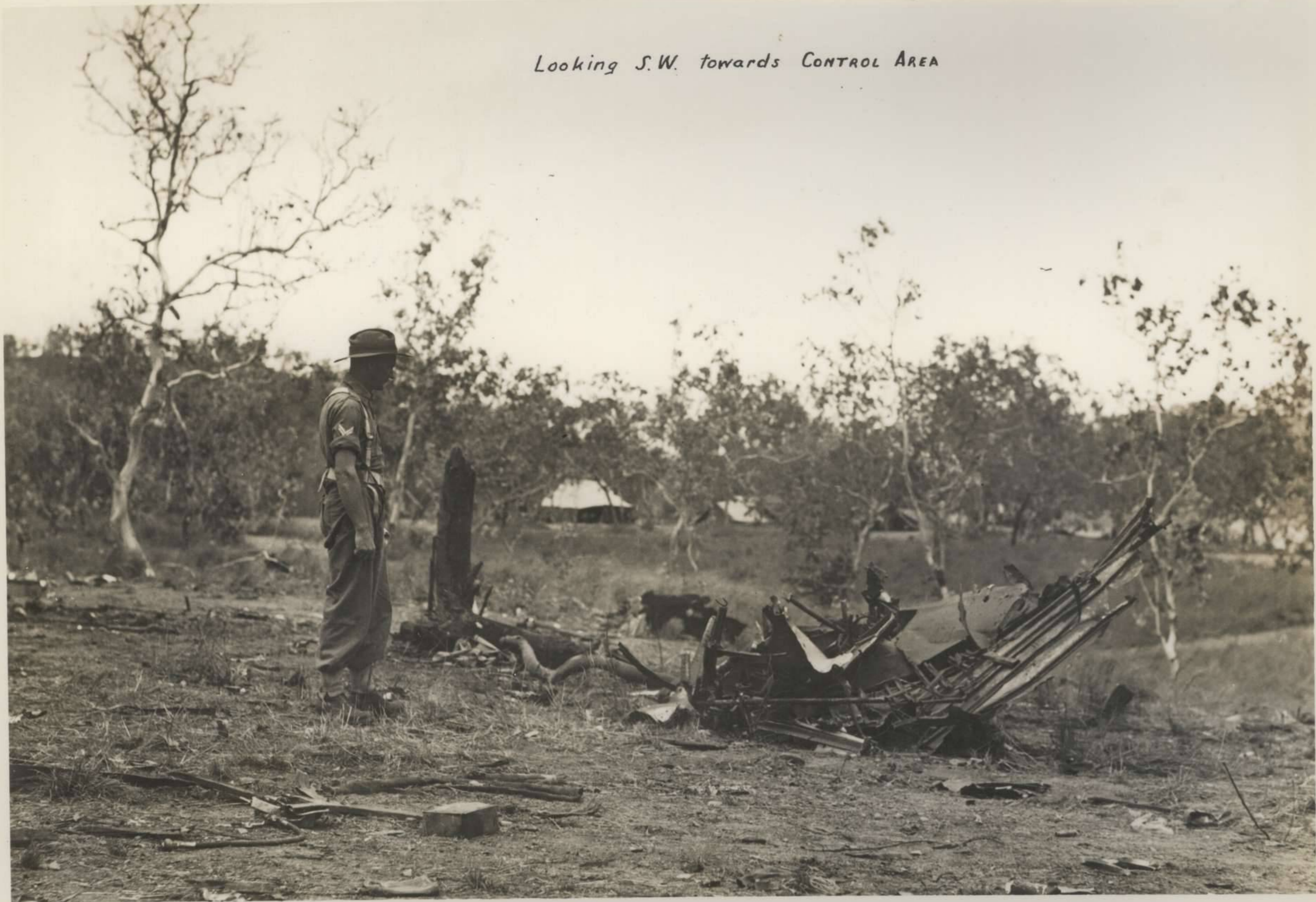
Looking S.W. towards CONTROL AREA