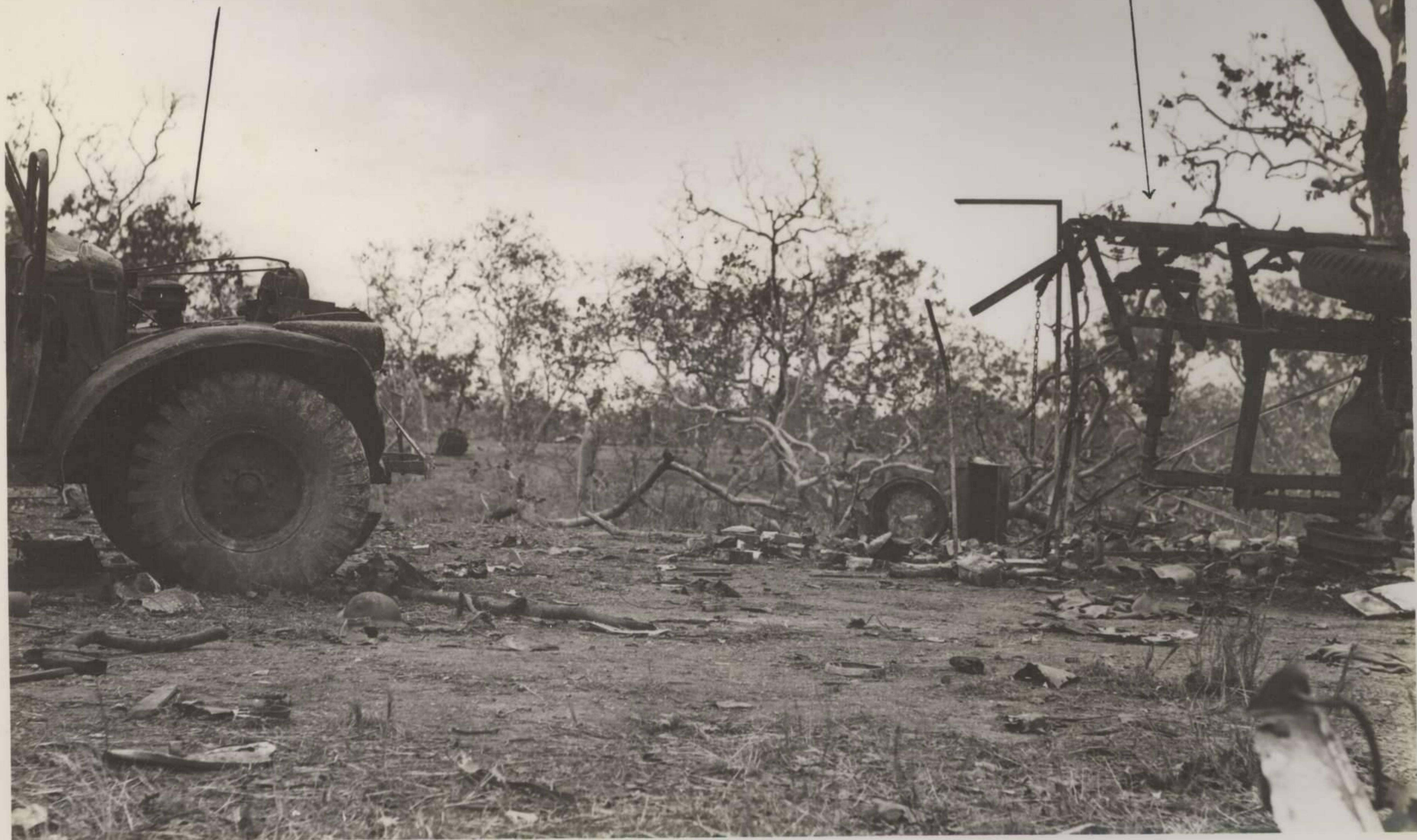
Truck No. 1.